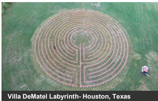
Villa DeMatel Labyrinth- Houston, Texas