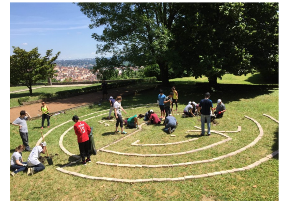
Stone & Turf Labyrinth- Lyon France