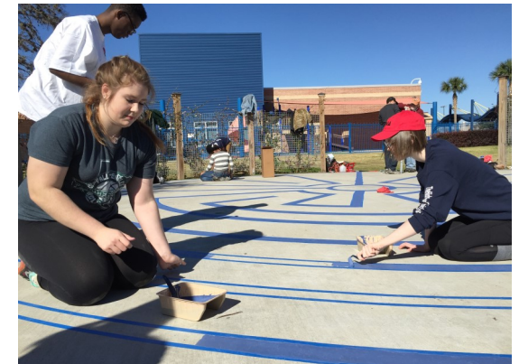
Man in the Maze Labyrinth, Rise School of Houston

We work with schools, churches, community centers, universities, retreat centers and other civic spaces to design and produce our one of a kind labyrinths.