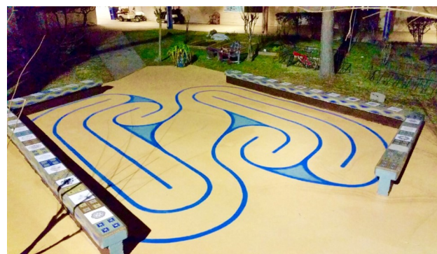
Sharpstown International School Labyrinth- Houston, Texas